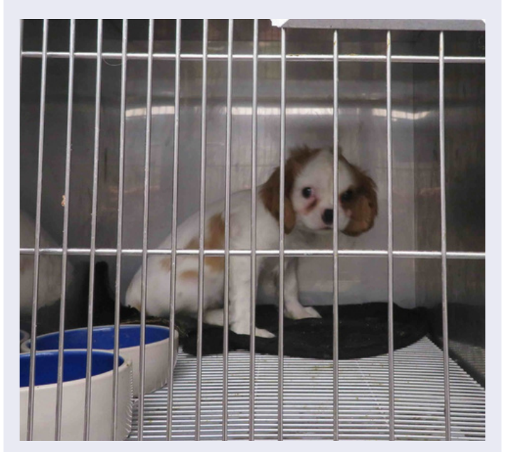
This dog, shipped by JAKS Puppies Inc. without any regard for the conditions he would be kept in, was housed in an enclosure so tiny he could not stand up fully.

JAKS Puppies, Inc. is one of largest puppy brokers in the country, selling and shipping puppies to pet stores in more than 20 states. The state of Iowa sued JAKS Puppies, Inc. in 2019.<sup>5</sup> alleging they illegally laundered hundreds of designer puppies through sham lowa nonprofit "rescues" to pet shops in states and cities that had prohibited the sale of commercially bred dogs. The organization, Hobo K9 Rescue, was licensed as a nonprofit but had the same address as JAKS Puppies. Inc., and was operated by JAKS Puppies' owners. The lawsuit accused Hobo K9 Rescue of misleading consumers about the true source of the puppies and abusing their lowa nonprofit status to circumvent state and local laws prohibiting the sale of commercially bred dogs. The nonprofit was dismantled, and the owners were fined. JAKS Puppies was sued again in 2021<sup>6</sup> by the Animal Legal Defense Fund, along with a network of individuals and businesses, for conspiring with California pet stores to sell puppy mill dogs intentionally mislabeled as rescues.