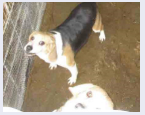
These dogs in Joyce Cairns' facility were kept in an outdoor enclosure with a wet cement floor soiled in feces.

Joyce Cairns is a commercial breeder in Kansas with over 100 dogs. She has a history of unacceptable animal care, including dogs kept outdoors in 11° F without adequate Additionally. protection from the cold. inspectors documented that water was too frozen to be drinkable, dogs had dental disease and heavily matted and dirty coats, dogs were living in jagged metal enclosures in which screws were protruding at dogs' eye levels, food buckets were without lids which could lead to contaminated food. floors were wet and soiled with feces, a dog had hair loss and exposed skin that was "thick and scaly," a dog had green eye discharge, a dog was very thin with the spine "visually protruding," and a was severelv emaciated with doa no appreciable body fat.