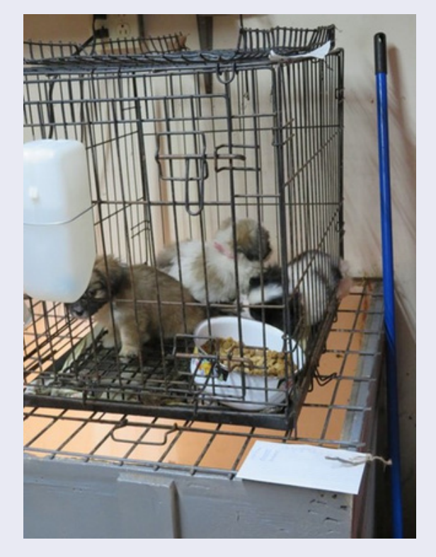
These puppies at Davis Kennel in Missouri were kept in cages much too small for them to be able to comfortably rest or move around.

However, in response to growing concerns about the health and welfare of pet store puppies, dozens of local governments, including cities, counties and municipalities within the Sunshine State have enacted their own laws or ordinances aimed at ending the sale of cruelly bred dogs in their communities. Some of these laws do not allow the sale of any dogs in pet stores, while others attempt to restrict sales from certain suppliers. Other laws allow existing stores to continue to operate, but they prohibit new stores from opening in the area.