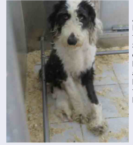
At Valleyview Premium Puppies, this Old English Sheepdog was emaciated, with her bones protruding and easily felt beneath her fur and feces coating the hair under her tail.

Valleyview Premium Puppies in lowa used multiple different license numbers and names, but all had the same address and were run by Lloyd and Loren Yoder. The USDA cited them dozens of times over the years for: loose wire wrapped around dogs' legs, shotgun shells on the ground of enclosures, standing water and heavy buildup of feces in enclosures, two severely emaciated dogs, dogs with open wounds, and more, before allowing them to cancel their licenses in 2022 without any repercussions. A year later, at a point during which the operation was under more direct state oversight, the dogs were finally rescued. The conditions were so terrible, however, that at least nine died in the days after the rescue.<sup>9</sup>